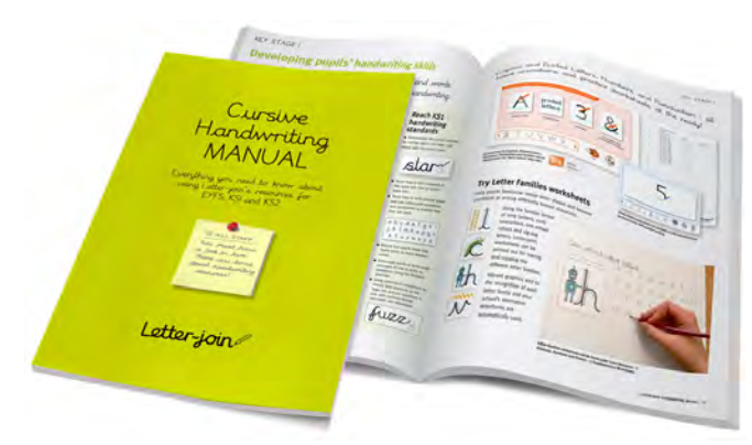
Letter-join's Cursive Handwriting Manual.

You can download a PDF of the latest Handwriting Manual here: <a href="mailto:www.letterjoin.co.uk/manual.pdf">www.letterjoin.co.uk/manual.pdf</a> or email <a href="mailto:info@letterjoin.co.uk">info@letterjoin.co.uk</a> if you would like a printed copy sent to you.